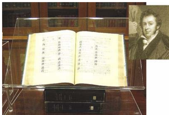
Robert Morrison, inset, and Dictionary of the Chinese Language

His Dictionary of the Chinese Language , which appeared in three parts, was considered one of his greatest works.