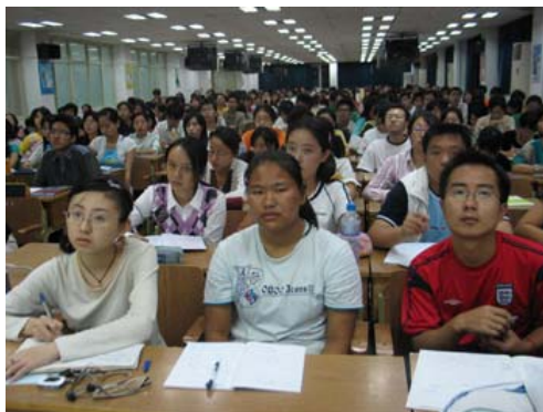
Students in New Oriental School

The largest English teaching organization New Oriental School set more than 20 branches, the number of students arrived to 800,000, the income will arrive to 700 millions Chinese yuans, The pure profits will arrived to 12%. Now New Oriental School will expand to 100 cities of China. It likes to become Wal Mart in English teaching.