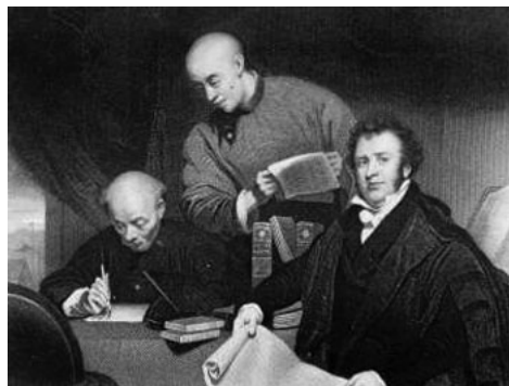
Morrison and his friends

200 years ago, January of 1807, a British missionary left from London in order to go to China. His name is Mr. Robert Morrison (1782-1834) . He passed through the Atlantic Ocean, America, South America and Pacific Ocean. And in September of 1807 he arrived to Macao and then he came to Guangzhou of China.