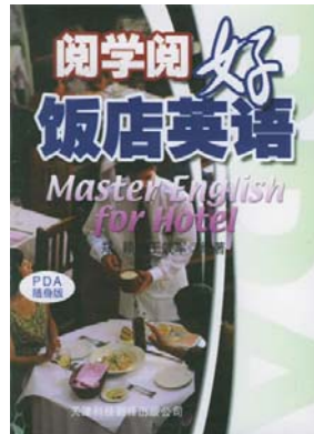
Master English for Hotel

More and more Chinese shall speak English in Olympic 2008, we try to set up a multilingual service system as follows: