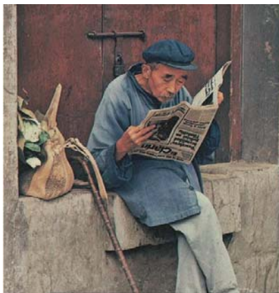
The old Chinese reading English Newspaper

In China, English became a top important language in the politics, business, science, technology, education, etc. Many Chinese people like to speak and read English, even the following old man also likes to read English Newspaper, he even can read English form down to top of the Newspaper.